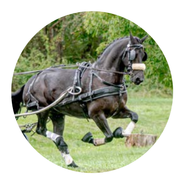
6yo Driving Eeltsje fan Cal Kafka Farms owned by Kafka Farms