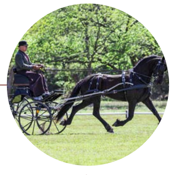
Region 3 Sjouke Plantinga