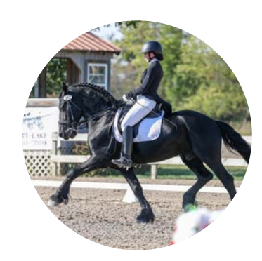
Riding Klaas S.F. Sport Elite