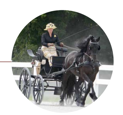
Driving Hamilton DCTF