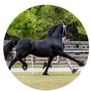
Stallion Norbert 444