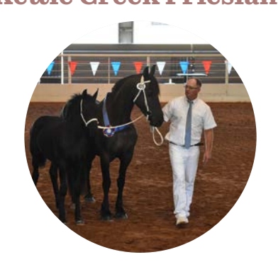
Bronze Kettle Creek Friesians Gull Lake Farm