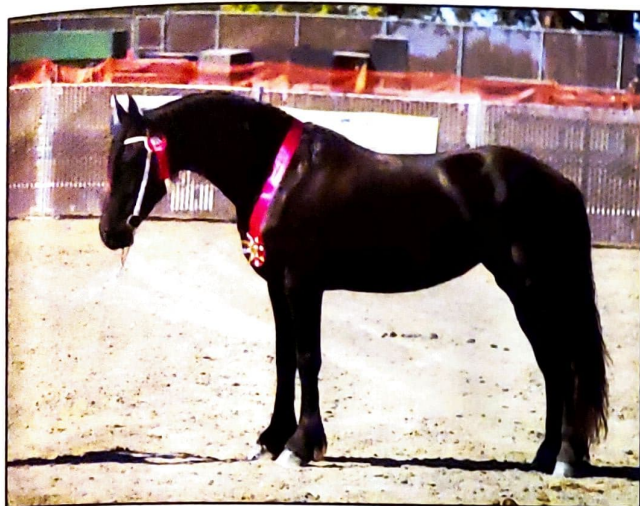
Ziva TCF, Star. Anton 343 Star Preferent x Sjaard 320.