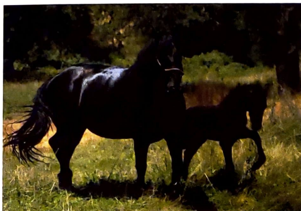
Sebeline Star, Preferent, Prestatie with Filly, Ziva TFC