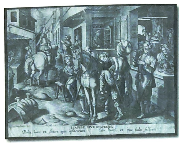
Etching based on Johann van der Straat

A discussion about the topic of baroque versus modern is inevitable when you are invited abroad to present an introduction about the breeding policies. So it happened on that Sunday when The Netherlands played Portugal for the world cup soccer. During a gathering in Verden in north Germany, the concern about the preservation of the baroque Friesian horse was shared. The same discussion was prominently shared by means of an internet questionnaire on the KFPS website. The central topic was the breeding goal of the studbook.