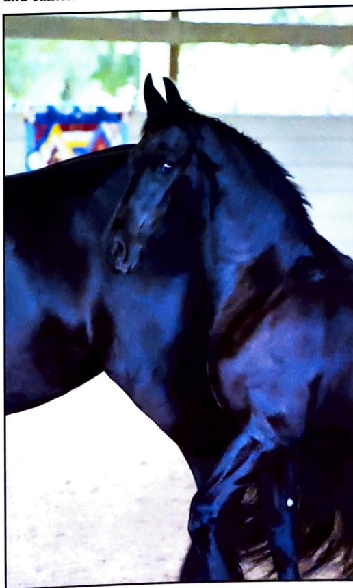
Wendee DCTF out of Dreams Come True Farm's Crown Mare Sjaantje Sport, taken at the Iron Spring Farm Keuring in Coatesville, PA..

All these little details make a difference. They keep potential buyer focused on your fancy horse instead of being distracted by the rusty tractor parked next to field. Keep the video to a few minutes in length, and be selective about which segments you include. Show off your horse's best moments at the walk, trot and canter.