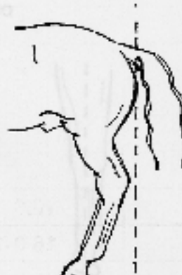
Sickle Hocked Standing Under

A straight line from the point of the buttocks should touch the back of the fetlock joint.