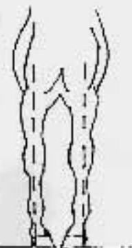
Toes In or Pigeon Toed