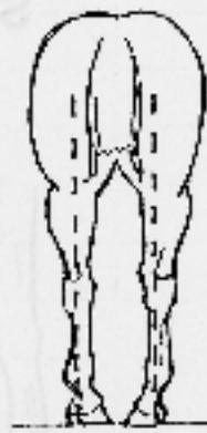
Bow Legged Pigeon Toed