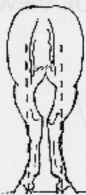
Cow Hocked Splay Footed