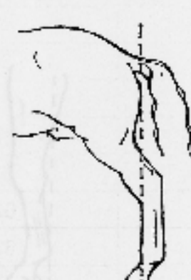
Standing Off Hocks or Carnped Out